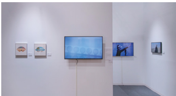
Installation View at "Art Taipei 2023" in October, 2023

展覽以藝術家近年發展的三件創作為基礎，嘗試探索人的感性經驗是如何在科技時代下被重新塑造。展場被視為是一個由人-機-自然三者共構的詩意場域，並由觀者的身體感與想像力作為中介參與，在與作品對話的過程中，產生一幅幅流動且豐饒的景觀。這些風景彷彿溪水般悠然流淌，卻又時刻夾雜著延遲與雜訊。在自然與科技的間隙之間，人於內在創造萬物。