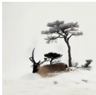
書譜：萬物演算 #3(動態影像) Calligraphedia: A Universal Algorithm #3 2024 單頻道錄像，生成式人工智慧，彩色， 雙聲道 Single-channel, Generative AI, Color, Stereo 2' 55" Ed. /5

《書譜：萬物演算》檔案化了藝術家過去臨寫的書法手稿，通過人工智慧分析其造型與筆觸，創造出帶有自然物的抽象文字。藝術家將機器學習視為一種書法的學習過程，兩者皆是通過分析與模仿大量的範本後，最終達到「人書俱老」的境界並產生創造。