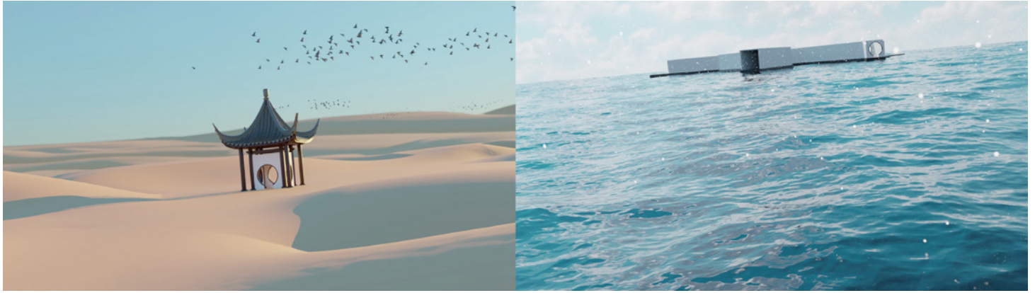
影答形, 雙頻道錄像, 2021, 3D電腦動畫, Full HD, 彩色, 雙聲道, 4' 50", Ed. /5 Shadow to Substance, 2021, Dual-channel Video, 3D Animation, Full HD, Color, Stereo, 4' 50", Ed. /5

受到東方園林啟發的雙頻道動畫《影答形》, 以「借景」為概念建構了迴圈式的虛擬自然。作品以第一人稱視角展開, 通過影像之間的交互追逐、復返與共時, 探索虛擬空間作為數位時代人們精神居所的可能性。