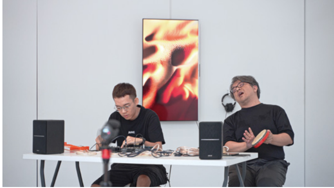
書譜：萬物演算(計畫介紹影片), 2023, Full HD (1920 x 1080)

展覽以藝術家近年發展的三件創作為基礎，嘗試探索人的感性經驗是如何在科技時代下被重新塑造。展場被視為是一個由人-機-自然三者共構的詩意場域，並由觀者的身體感與想像力作為中介參與，在與作品對話的過程中，產生一幅幅流動且豐饒的景觀。這些風景彷彿溪水般悠然流淌，卻又時刻夾雜著延遲與雜訊。在自然與科技的間隙之間，人於內在創造萬物。