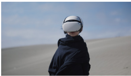
器海 Sunyata (平面作品) 2023 藝術微噴 Inkjet Print H33 x W55 cm Ed. /6

Inspired by oriental gardens, the dual-channel animation Shadow to Substance takes after the concept of “borrowed sceneries” to build and loop virtual sceneries of nature. The artwork unfolds from a first-person perspective and explores, through the alternating pursuit, reoccurrences, and synchronicities between the images, the potential of the virtual space as a spiritual abode for people in the digital age.