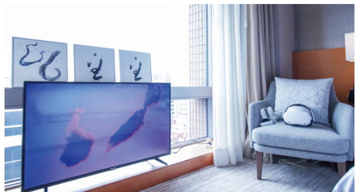
Installation View at "One Art Taipei 2024" in January, 2024

Calligraphedia: A Universal Algorithm, archives the calligraphy manuscripts previously practiced by the artist by using artificial intelligence to analyze their shapes and brushstrokes, an operation resulting in the creation of abstract ideograms imbued with elements of nature. The artist regards machine learning as a method akin to the process of learning calligraphy, where each of the two involves the analysis and imitation of an immense set of models, after which, a state of "maturity in both the person's character and calligraphy" is eventually achieved, along with the ability to generate artistic creation.