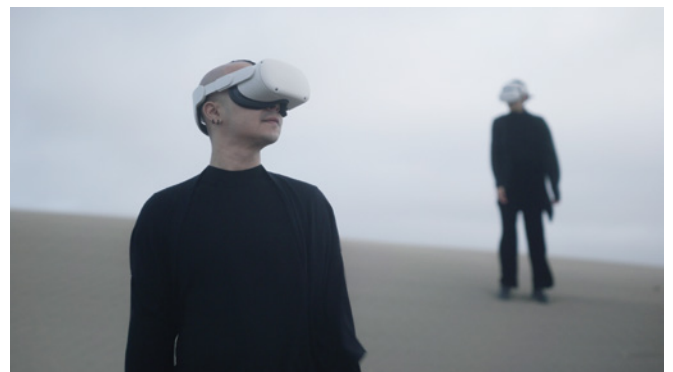
器海(動態影像), 2023, 單頻道錄像, 彩色, 雙聲道, 2' 56", Ed. /5 Sunyata, 2023, Single-channel Video, Color, Stereo, 2' 56", Ed. /5

以沙為元素, 《器海》嘗試通過混合實境消解虛擬與自然空間的邊界, 並在自然場域中創造幽微的感知經驗。觀者遊走於沙丘的同時, 時而將其包覆, 又時而散落在虛擬環境中的岩石, 暗示著體驗者在這異質的空間裡, 身體彷彿暫時幻化為一粒微塵, 消散在宏觀的時間之中。